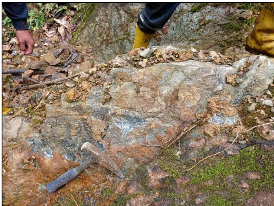
Figure 5 – Quartz Monzonite Outcrop Displaying Stockwork Veining with Quartz, Molybdenite, Chalcopyrite and Copper Oxides Grading 0.6% Copper