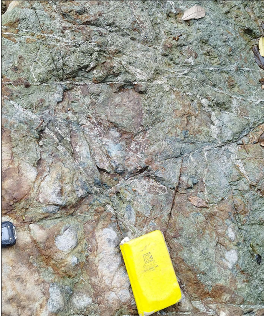
Figure 2 – Altered Quartz-Diorite Porphyry Outcrop Displaying Quartz-Pyrite-Chalcopyrite Stockwork with Secondary Chalcocite