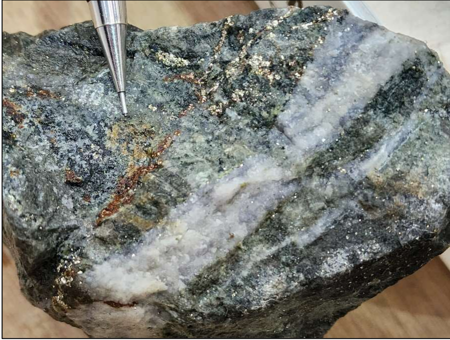
Figure 4 – Altered Diorite Specimen Displaying Pyrite and Chalcopyrite in Veinlets and Disseminations, with Chalcocite and Malachite